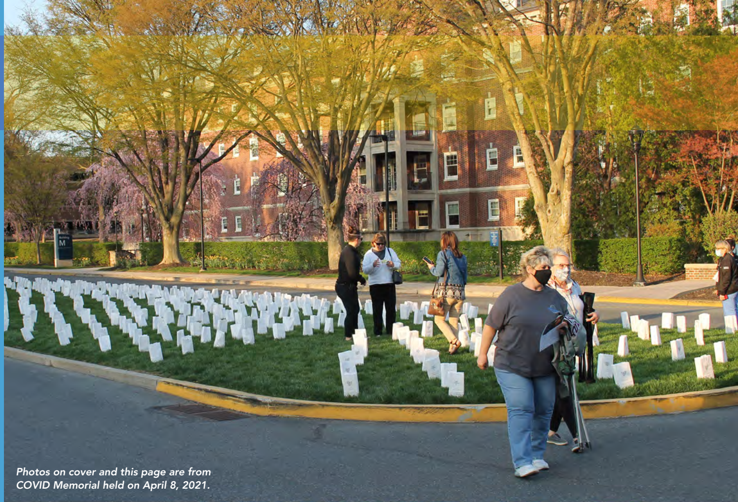
Photos on cover and this page are from COVID Memorial held on April 8, 2021.